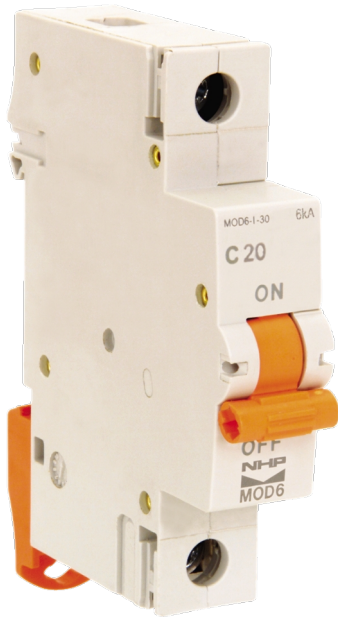
Representative Photo Only (actual product may vary based on configuration selections)